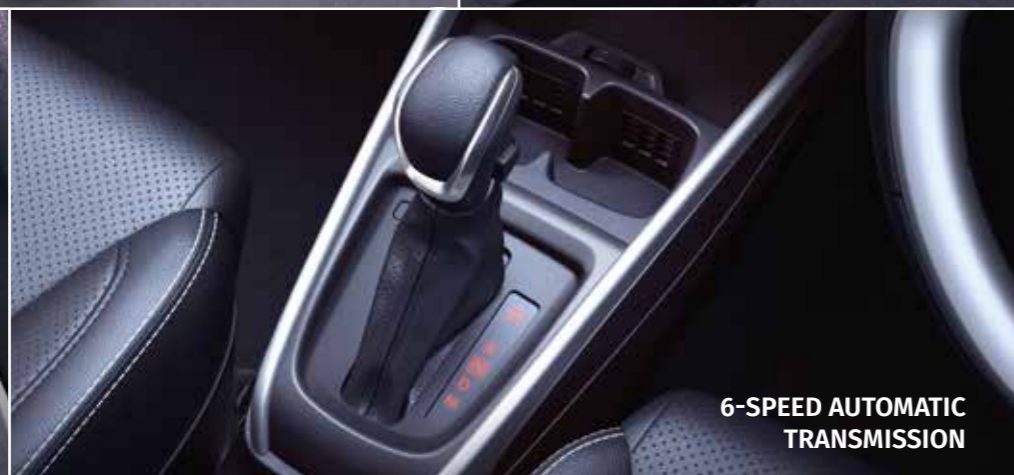
6-SPEED AUTOMATIC TRANSMISSION