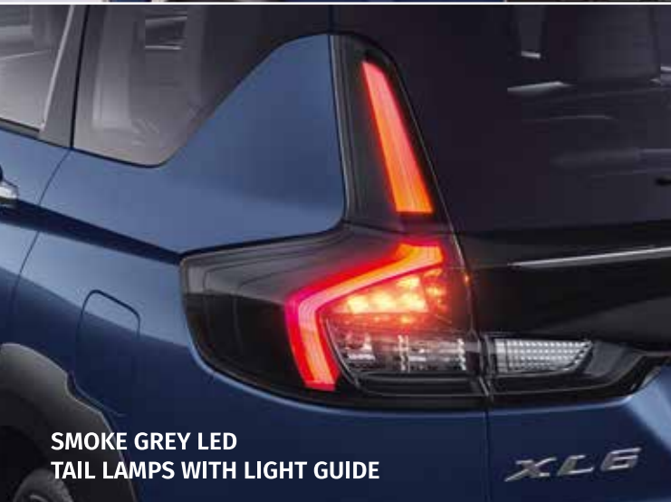
SMOKE GREY LED TAIL LAMPS WITH LIGHT GUIDE