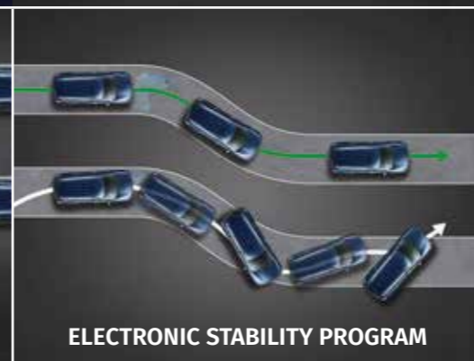
ELECTRONIC STABILITY PROGRAM