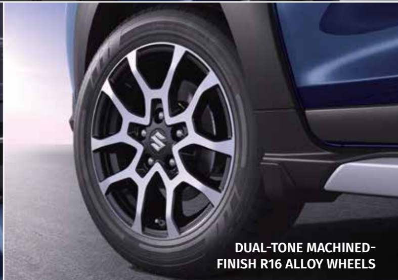
DUAL-TONE MACHINED-FINISH R16 ALLOY WHEELS