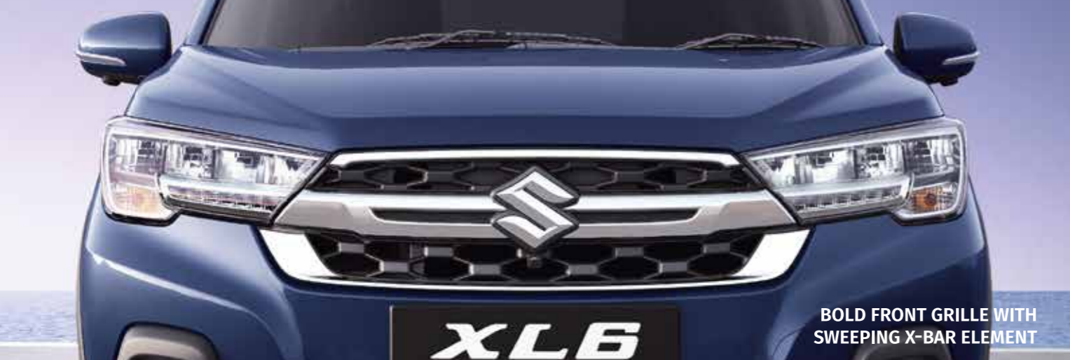
BOLD FRONT GRILLE WITH SWEEPING X-BAR ELEMENT