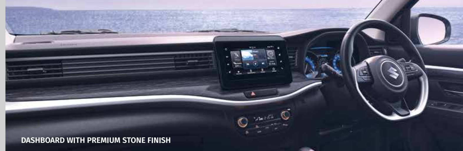
DASHBOARD WITH PREMIUM STONE FINISH

Featuring a distinct new Front Chrome Grille with a Sweeping X-Bar that flows smoothly into the Quad Chamber LED Headlamps as LED DRLs, the All-New XL6 makes its presence felt. The distinct hood is complemented by aggressive shoulder lines that firmly highlight its body contours and seamlessly flow into the Smoke Grey LED Tail Lamps, carrying the powerful design from the front to the rear. Sporty Roof Rails, a Back Door Spoiler and the new Shark Fin Antenna radiate an unmistakable sense of style while the striking Dual-Tone Machined-Finish R16 Alloy Wheels evoke a sense of stability whenever you take it out for a spin.