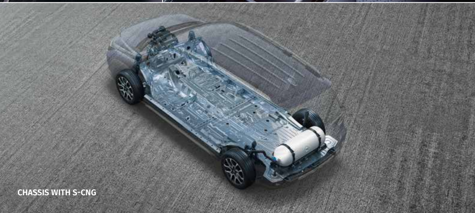
CHASSIS WITH S-CNG