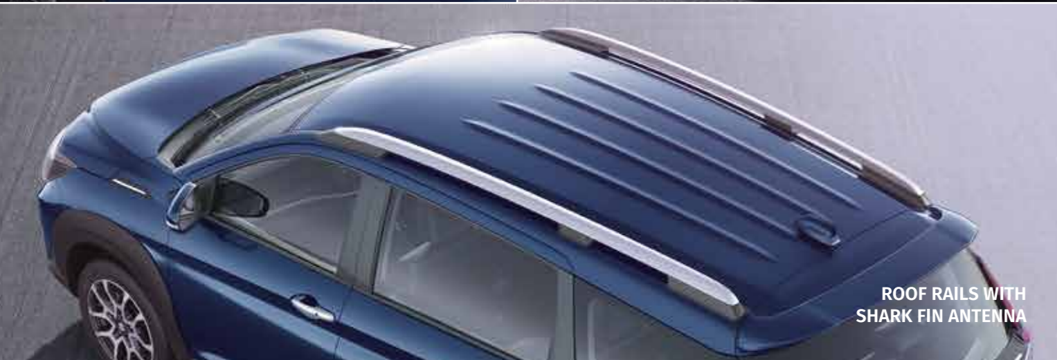
ROOF RAILS WITH SHARK FIN ANTENNA