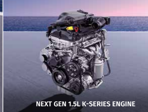
NEXT GEN 1.5L K-SERIES ENGINE