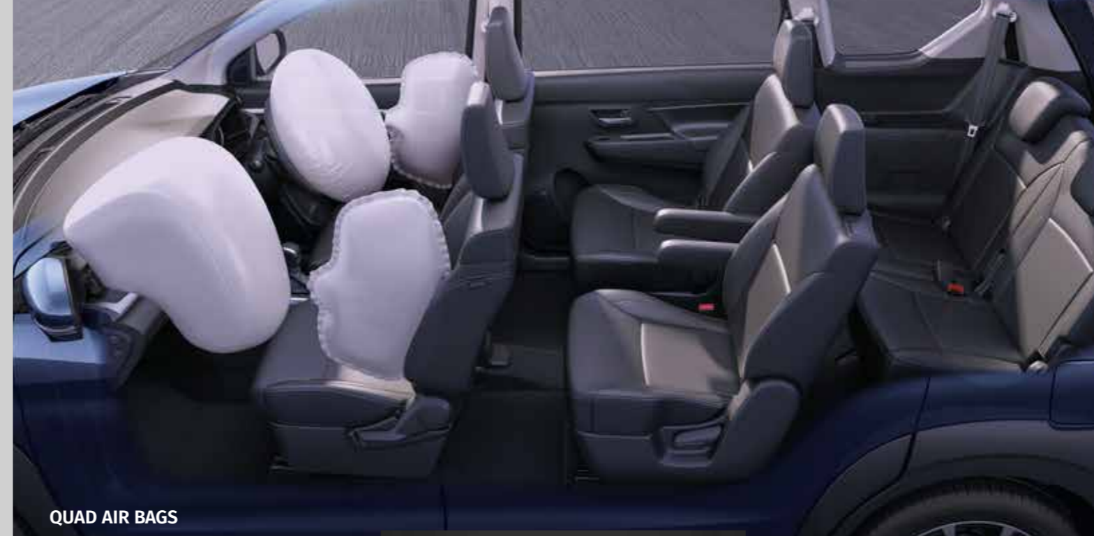
QUAD AIR BAGS

Image is only for illustration purposes. S-CNG Zeta variant has one fire extinguisher below co-driver seat for safety purposes. For details on the functioning of air bag and other safety feature kindly refer to owner's manual of vehicle