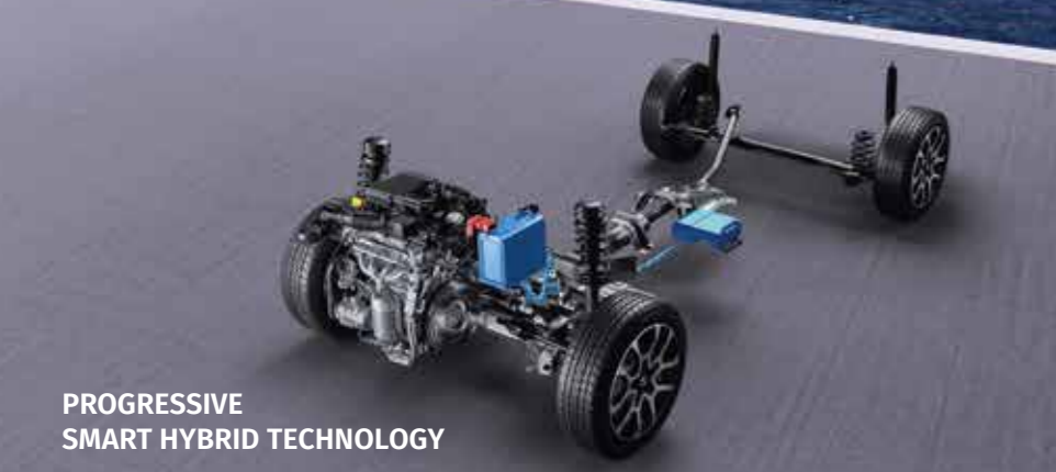
PROGRESSIVE SMART HYBRID TECHNOLOGY