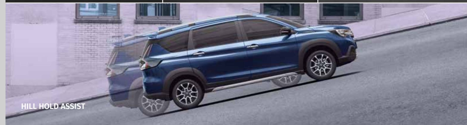
HILL HOLD ASSIST

In addition, the All-New XL6 has ISOFIX Child Seat Mounts, Speed Alert System, Driver and Co-driver Seat Belt Reminder, Rear Parking Sensors and many more features dedicated to your safety and comfort when on the move.